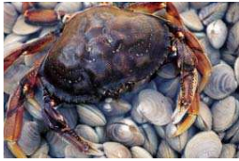
Crab Capital of Oregon